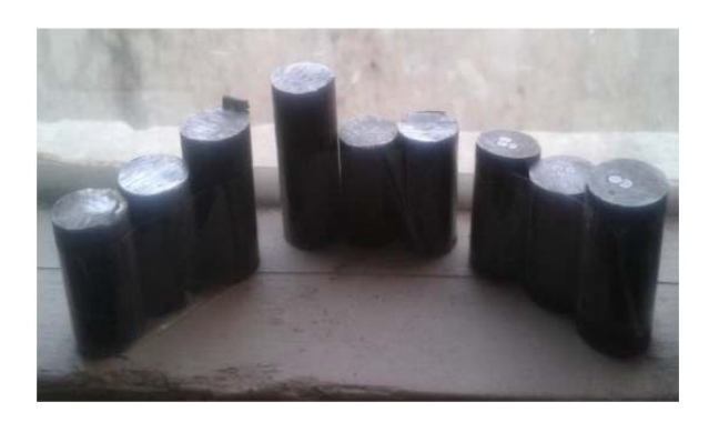
Fig 7. Overview of all specimens related with the study